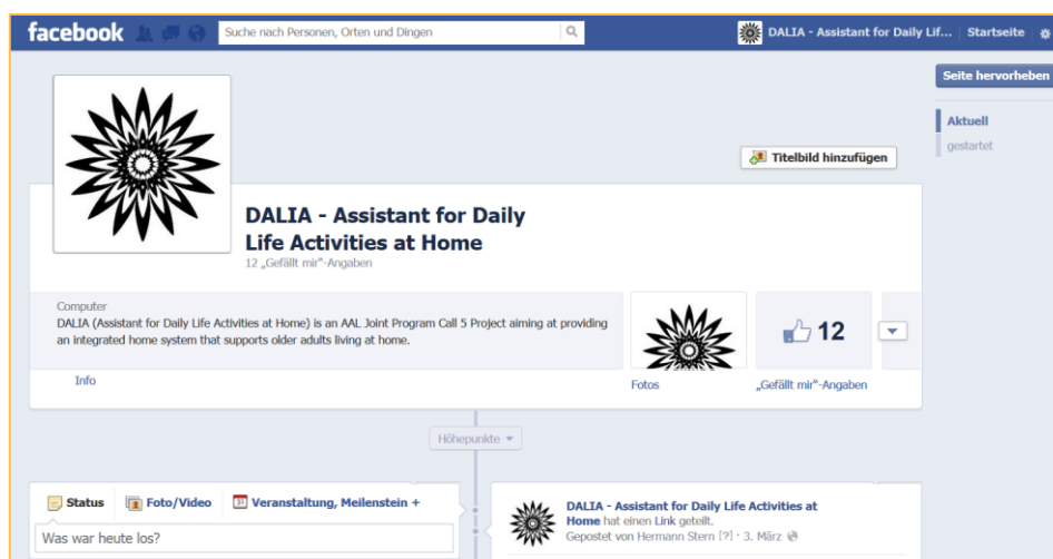
Figure 6: DALIA Facebook Page

Since June 2013 content from the DALIA Webpage is also automatically transferred to social media platforms like Facebook or Twitter, offering the possibility to discuss individual entries or news.