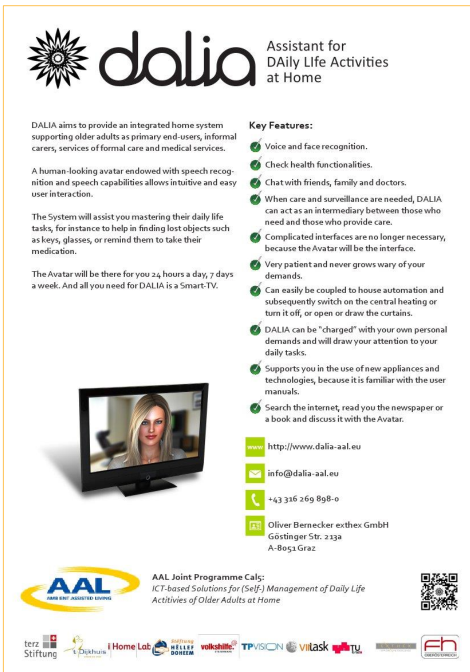
Figure 4: DALIA Press Kit – Flyer

As development of DALIA goes further and things get more concrete, the DALIA consortium aims at releasing high-level information regarding the progress to the press on a regular basis.