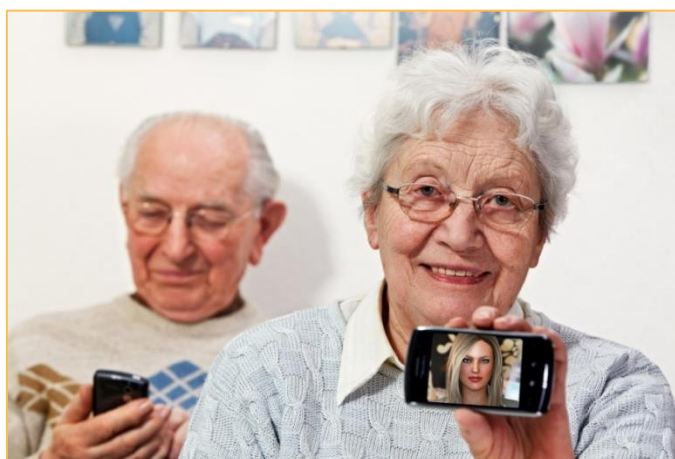
Figure 3: DALIA Press Kit – Images

A DALIA press kit has been compiled containing images and textual project abstracts to be handed out to for instance newspapers, conferences or interested companies. In addition a flyer summing up the main unique selling propositions has been created.