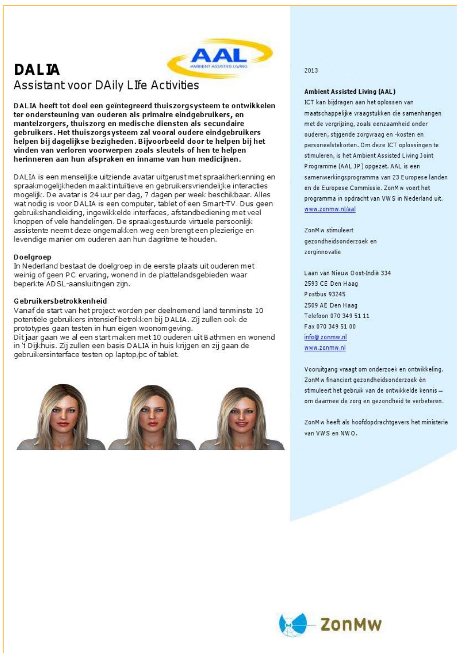
Figure 5: Dutch DALIA Flyer

To spread the word about DALIA the consortium in particular aims at visiting local conferences and events and be present there with information material about DALIA (the existing Press Kit, current Screenshots, Demo Videos, PowerPoint Slides, etc.).